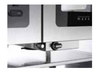
Recoil hand shower

The effective ConvoVent 4/4+ condensation hood also fits on the Convotherm maxx. It provides a continuously safe and pleasant working environment with a fresh room climate.