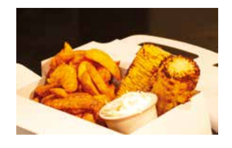
Quantities in a Convotherm maxx 10.10:

The active, three-level moisture removal in the cooking chamber in hot air mode creates an exceptionally crispy crust in no time while still maintaining a tender core - and it works uniformly across all shelves. For take-away and deliveries, this ensures that everything can be served at home still tasty and fresh, and with the desired texture.