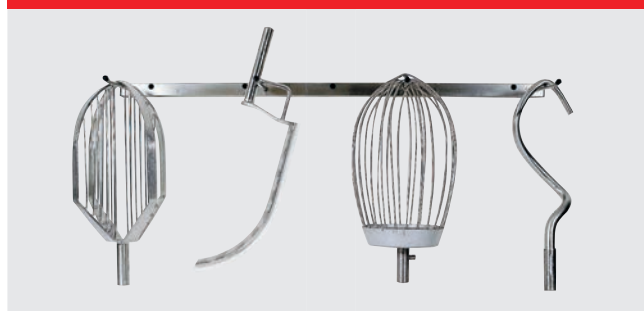
Tool rack, 91 cm