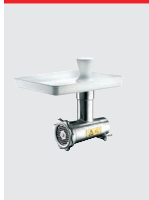
Meat mincer, 70 mm