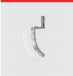
Automatic scraper in stainless steel. Nylon or teflon blade. 20L and 20/12L.