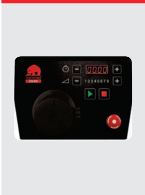
Attachment drive for meat mincer and vegetable cutter