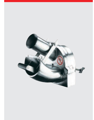
Vegetable cutter GR20