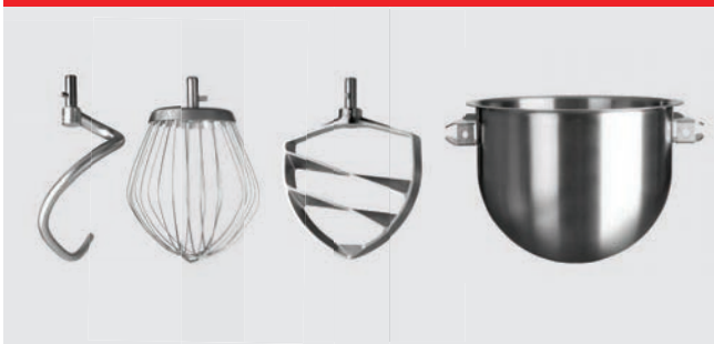
Hook, whip, beater and bowl 20 L in stainless steel.