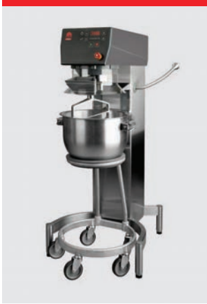
Stainless steel, 20 L floor