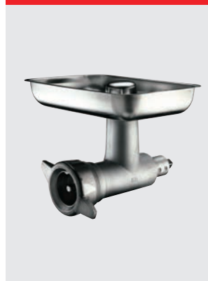
Meat mincer, 82 mm