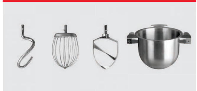
Hook, whip, beater and bowl 20/12 L in stainless steel.