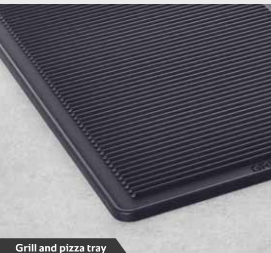
Grill and pizza tray

Our UltraVent condensation technology is also available in an UltraVent Plus model, which is equipped with special filters. to prevent steam as well as bothersome smoke that could otherwise develop when grilling or roasting. RATIONAL units can thus be installed even in critical locations, such as front shop-front areas.