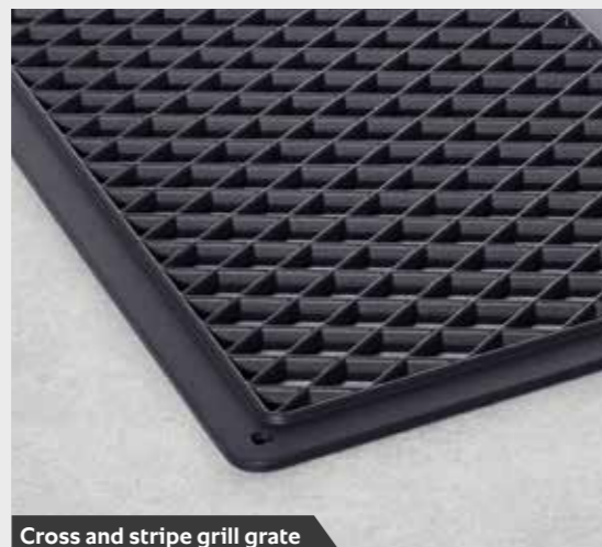
Cross and stripe grill grate